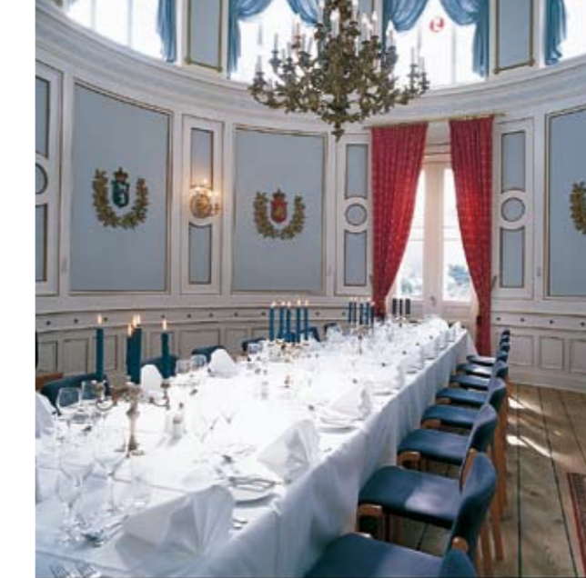
King Frederik the VII bought the estate “Skodsborg” in 1852. State councils and royal functions took place in Villa Rex, which was built in 1857.